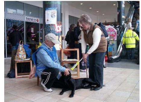
helping to raise funds