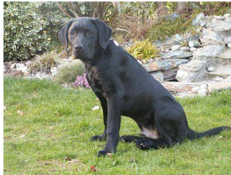
Relaxing in the garden