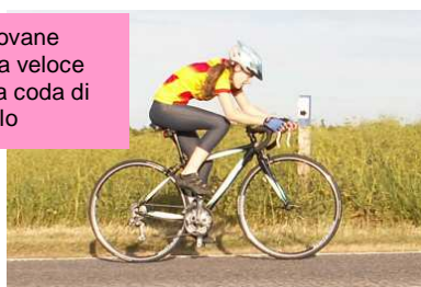
La giovane donna veloce con la coda di cavallo