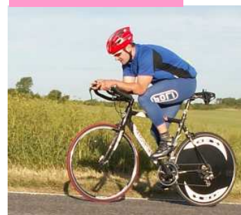
Gambe come pistoni!