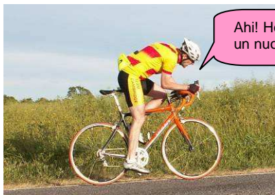
Ahi! Ho dovuto usare un nuovo rasoio!