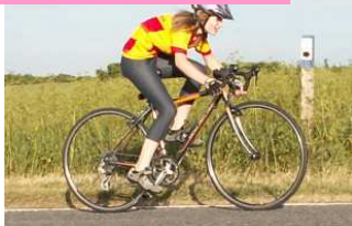
La ragazza superleggera