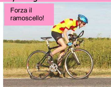
Forza il ramoscello!