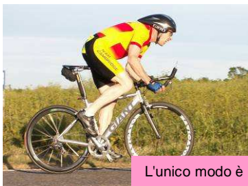
L'unico modo è Essex