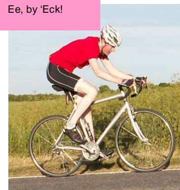
Ee, by 'Eck!