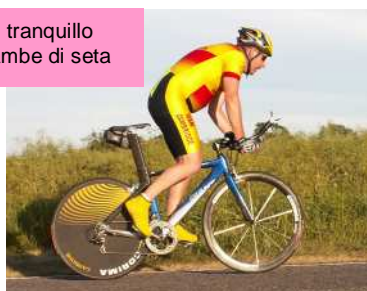
Un uomo tranquillo con le gambe di seta