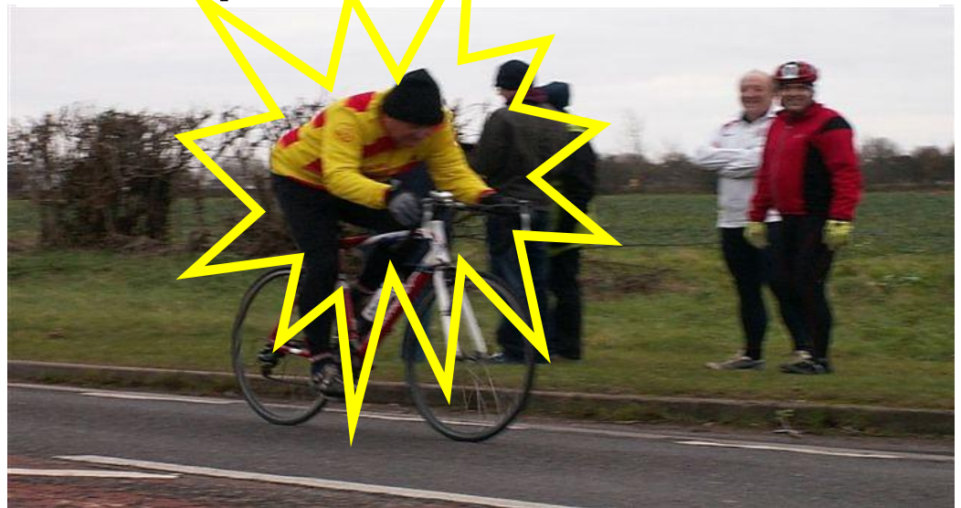
Special New Year Race Report, with photos!