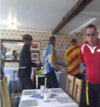
Cake stops can get competitive, though...

Tony received the following message, and circulated it to the masses:-